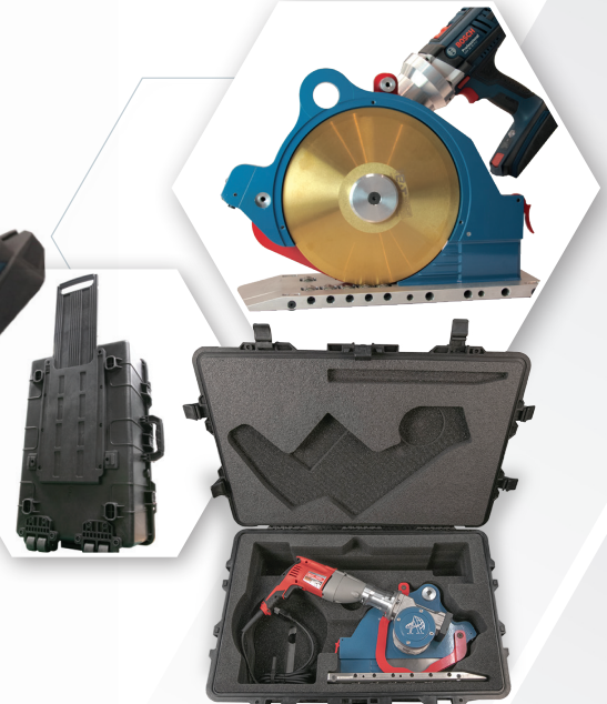
Cordless Belt Saw in case