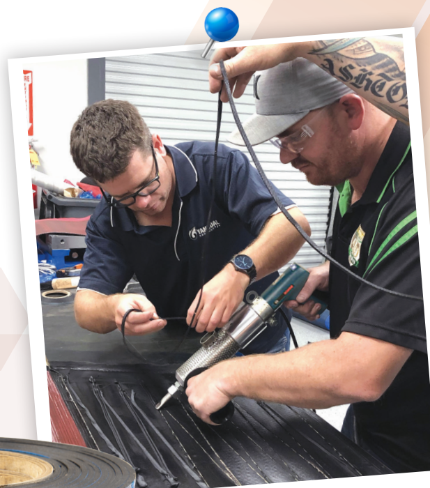
Bosch Noodle Extruder (sold separately) PT-EXT-110, PT-EXT-220