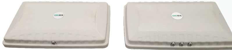
EMSYS LSRS Transmitter and Receiver