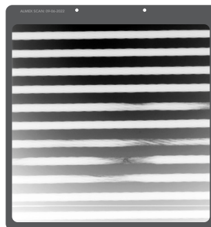
X-RAY showing damaged cables